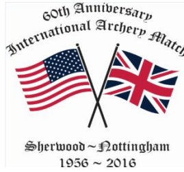
design on the shirt